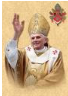
May 15, 2008 Pope Benedict prays for Baptism of the Holy Spirit